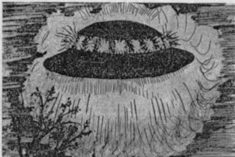
FLYING SAUCER: An engineer's impression of the invaders